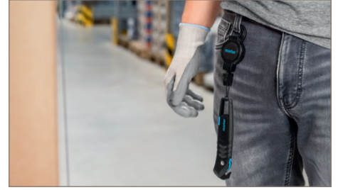
Knife at rest (without open blade).